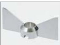
Rotating plate ※ Ultra speed turning plate rub the foodstuff on the drum then grate.

Multi Slicer (Specification for factory)