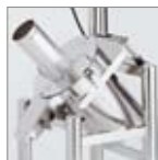
Insertion slot (1 slot type)

It can be done for completely coarse grated radish confined tightly flavor and moisture to the grain of crispy. Also, taste and texture can be changed by changing the drum's coarseness, make more adds-value to the grated radish.