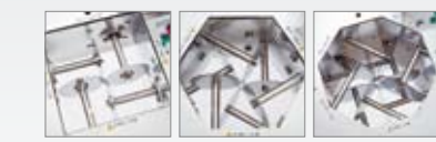
V4 V6 V8