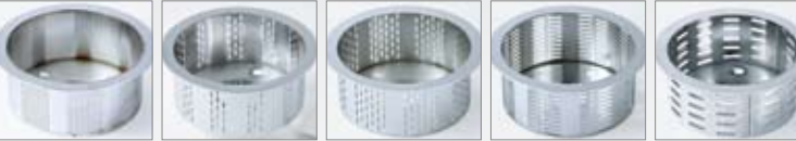
Extra fine Fine Medium Coarse Extra coarse

Non-standard carrot in high value- added products "carrot juice"