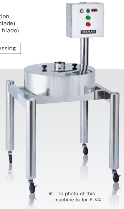
※ The photo of this machine is for F-V4

2010 Kawaguchi City Incentive Scheme Promoting New Product Development Winning a bounty for the In-air Cutter for Substandard Raw Peaches for F-Series.