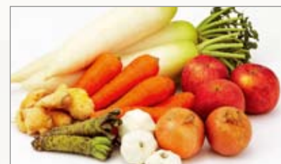
Sample of vegetable available

Using DX-660 to grate as such the non-standard apples which could not be sold to the super markets, it will reborn to be a nutrient-rich as a high value-added juice products.