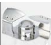
Rotating plate ※ The high-speed rotation plate with a block-cutter.Rub the radish to the grating-drum.