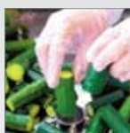
Example: The insertion slot for cucumbers